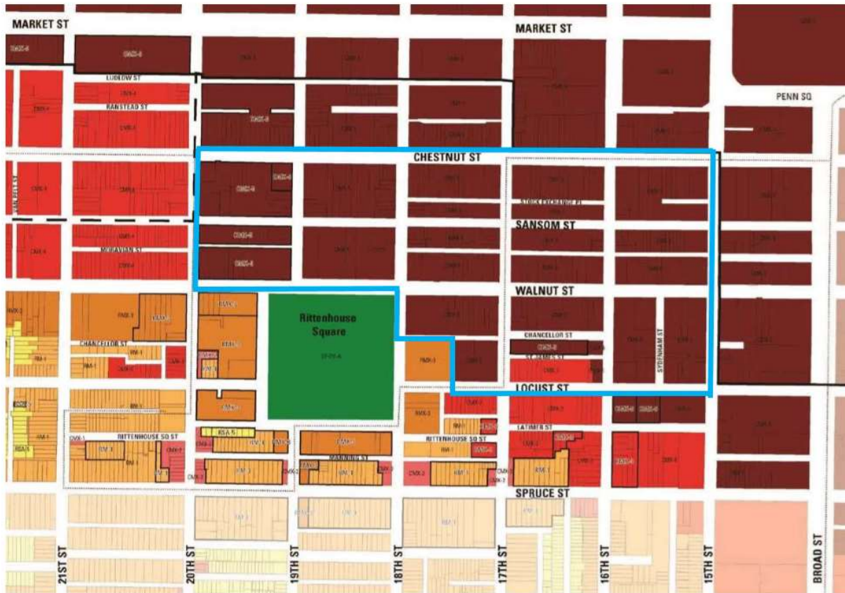
January 30, 2020 – Remapping Task Force Revised CMX-4 Lite Downzoning