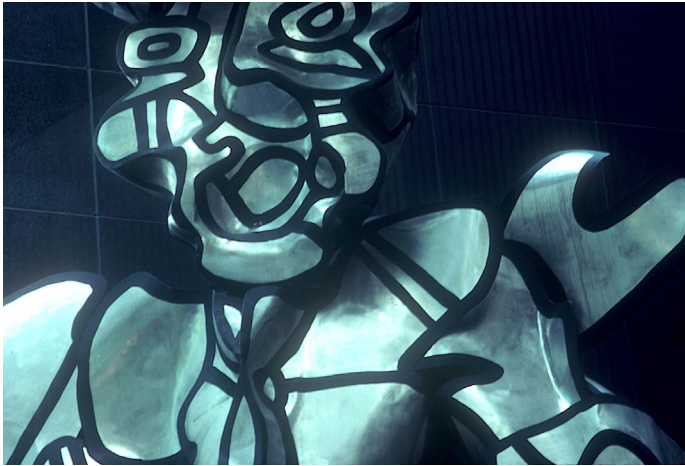
Milord la Chamarre, outside, 1993.

Years ago, a kindly and well-informed docent at the Philadelphia Museum of Art explained cubism to me. Basically, she said, cubism disarticulated the surfaces of a cube and rearranged them in a novel fashion, and I think you can see that in Jean Dubuffet's Milord la Chamarre . Body parts have been separated, flattened and sometimes crumpled, and then (tentatively) reattached. I sometimes think he looks like he's in the initial stages of exploding. Sometimes I think he's about to fall apart. And sometimes I think he's just angry.