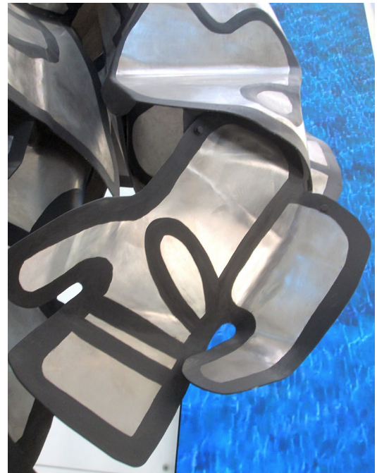
Here's a detail of the lower right leg. This plate, just above the foot, reminds me of a soccer shin guard. If you think it's armor, call it a greave. Note the rivets. (They're in the black.)