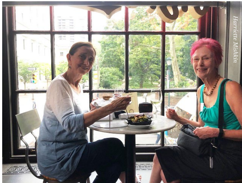
Penn's Village members make connections.

The Penn's Village mission is to "assist older neighbors to live independently... by providing caring services and programs that increase social engagement through a network of volunteers."