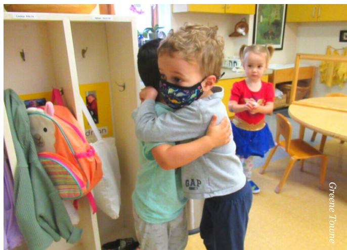
Toddler friends hugging.

Over its 55-year history Greene Towne has helped thousands of young children grow into lifelong learners and leaders. Greene Towne Montessori School serves children 18 months old through Kindergarten, and is accredited by the American Montessori Society and the Pennsylvania Association of Independent Schools. To learn more, and to get information on future parent education workshops, visit www.gtms.org .