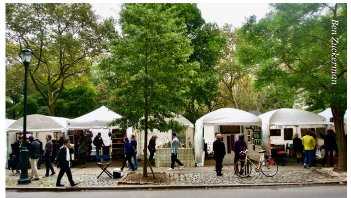
Rittenhouse Square Art Show.

To get the latest news about events in Center City, sign up for (IN) Center City, the e-newsletter of the Center City District: http://www.centercityphila.org/incentercity/signup.php