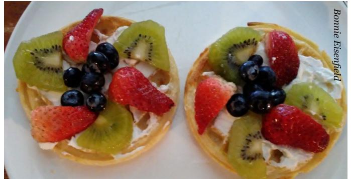
Quick, easy, tasty, and healthy Pi Day tartlets: round toasted waffles topped with sliced fruit and yogurt.

he was a longtime employee. It happened at a staff retreat following the death of Exploratorium founder and Nobel Prize nominee Frank Oppenheimer. (The date is also Albert Einstein's birthday.) In 2009, Pi Day, March 14, was officially recognized as a U.S. holiday, and is celebrated around the world.