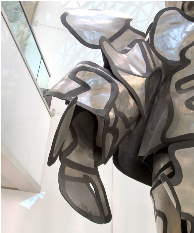
Left hand. I don't know why, but this is the only part of the statue that makes me feel comfortable. And no, I have no way to relate this hand to human anatomy.